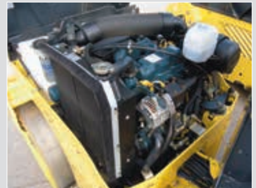
Easy access to engine and drive components for simplified servicing