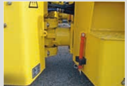
Bolt-on, maintenance free, center-joint with standard crab steer off-set, provides long life and ease of repair.