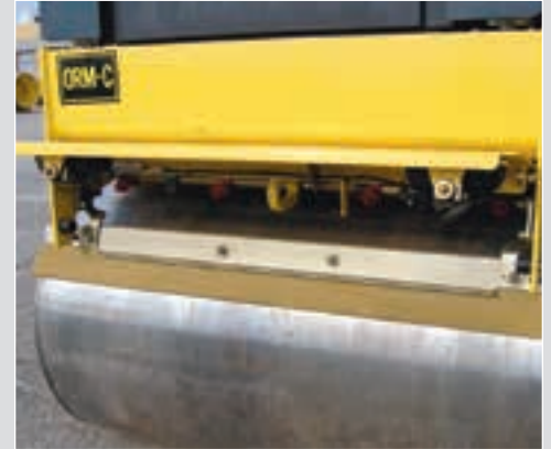
Wind protected, quick-disconnect spray nozzles with dual scrapers per drum.