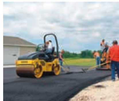
BW120AD-4 shown with optional folding ROPS.