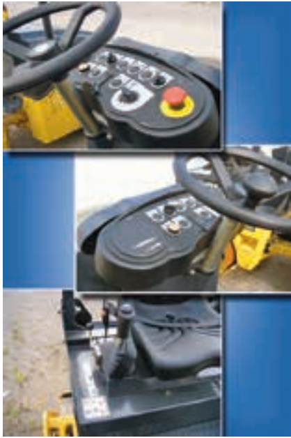
Ergonomically engineered operator's platform providing optimum comfort and maximum productivity.